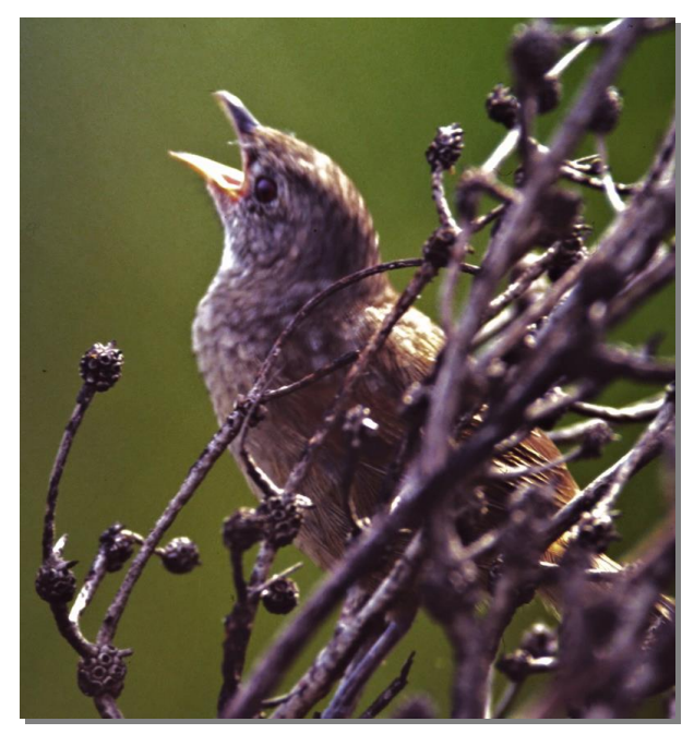
Western Bristlebird in a burnt shrub at Dogger Swamp, FRNP, early Jan. 1990 after a fire late Dec. 1989.